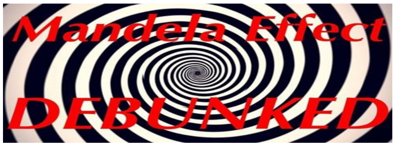
"After further examination, time with God, and fellowship with trusted brethren, I must say that I do believe this is all a demonic PSYOP to make many question God's Holy Word, question their sanity, and also to discredit the truth movement. 9